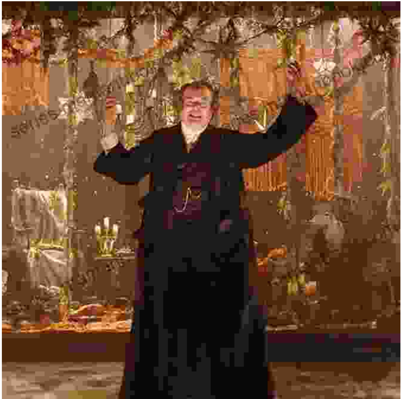
A Festival of Festive Splendor

breathes new life into the beloved story of Ebenezer Scrooge, his transformation, and the true meaning of Christmas. With stunning costumes, enchanting music, and evocative sets, the performance transports audiences to a bygone era, reminding them of the timeless magic of the holiday season.